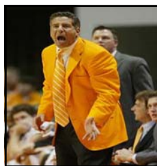
Basketball coach Bruce Pearl was fired by the University of Tennessee in March for recruiting violations

Jim Tressel a cheater? Is he a bad person? I don't know for sure. However, I can say that it appears his moral compass was off, at least for a moment. Unfortunately, Jim Tressel is but one